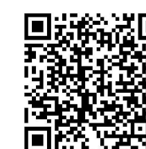
Figure 3. Design of Informed Consent Proposal

Proposal of a multimedia app/website for patients to complete the informed consent form, communicate with healthcare providers, and learn about genomics is provided here.