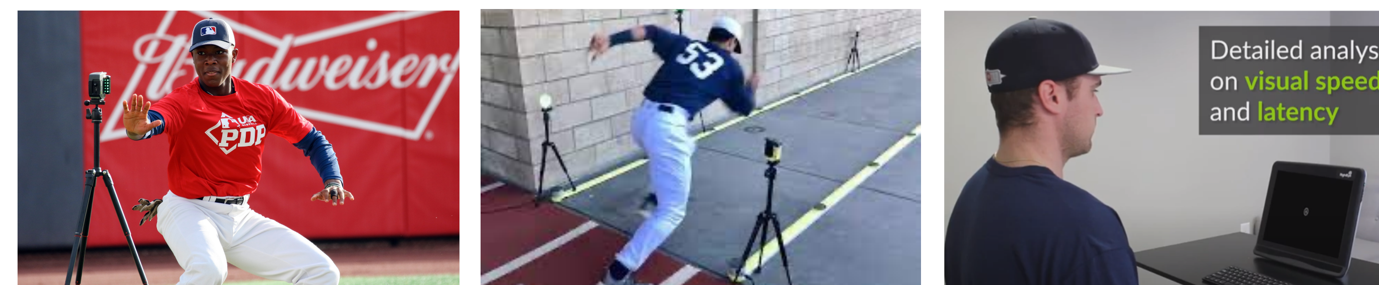
Figure 1: Examples of PDP data collection (left and middle) and RightEye data collection (right).