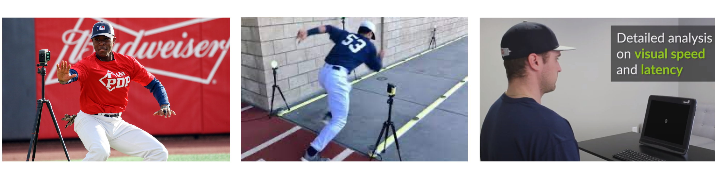
Figure 1: Examples of PDP data collection (left and middle) and RightEye data collection (right).

• Consists of several eye-tracking and visual-motor test scores that evaluate reaction time and concentration proficiency.